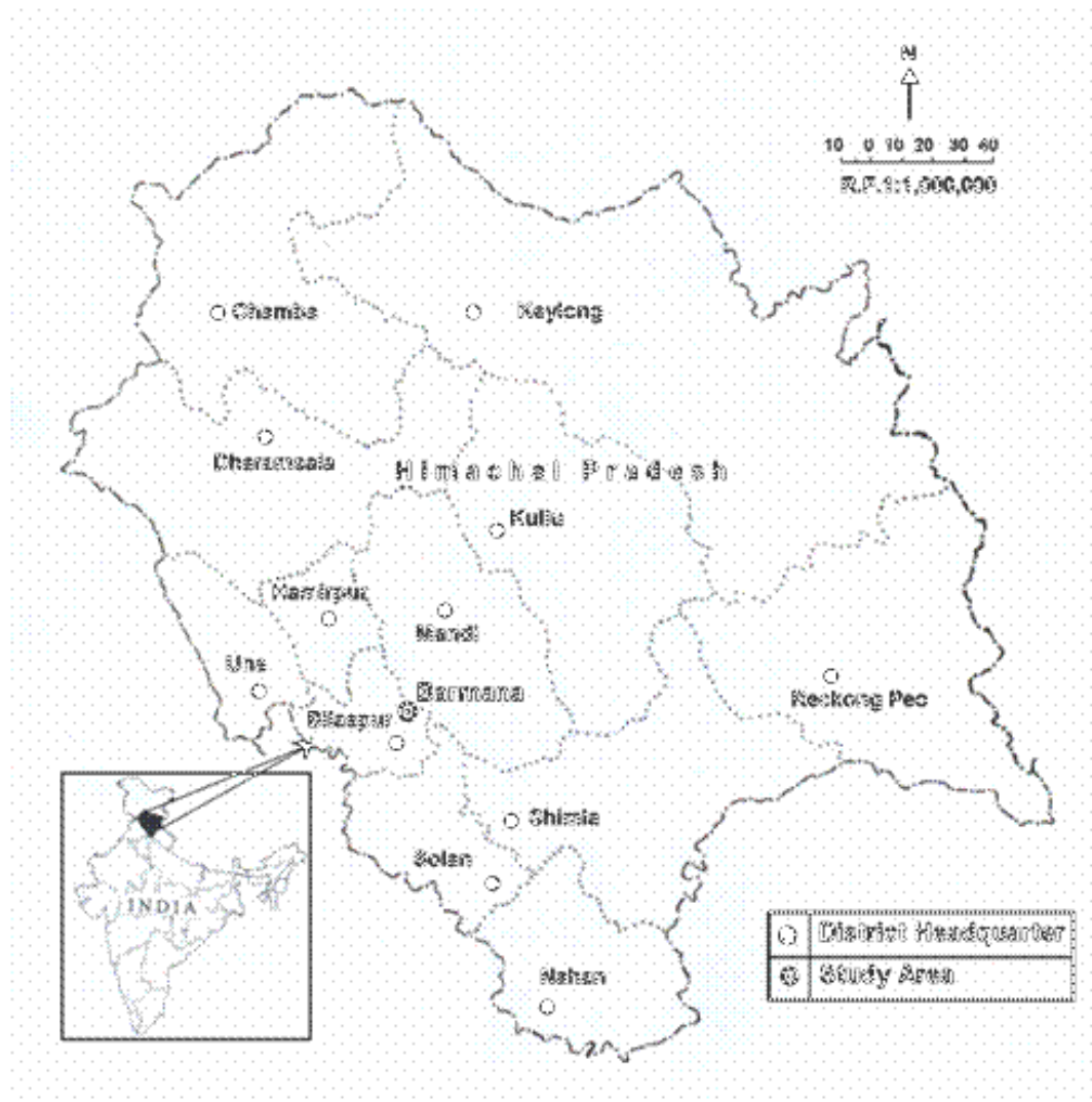
Figure 1: Location map of the Study Area

Barmana is situated at 31 o 25.022` N Latitude and 76 o 49.789` E Longitude at an altitude 547m amsl. This region lies on both the banks of river Satluj which forms the boundary between Mandi and Bilaspur districts and is about 18 Km north of Bilaspur connecting Ambala and Manali on National Highway NH-21 as in Fig.1.